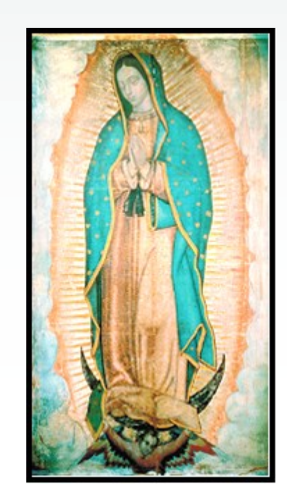
Relic Image of Our Lady of Guadalupe Located in the Mother of America Perpetual Eucharistic Adoration Chapel

The Marian Center for Peace is also privileged to be the caretaker for a set of traveling images of Our Lady of Guadalupe and the Divine Mercy. These images have been taken to pro-life events, Marian conferences, and Eucharistic processions.