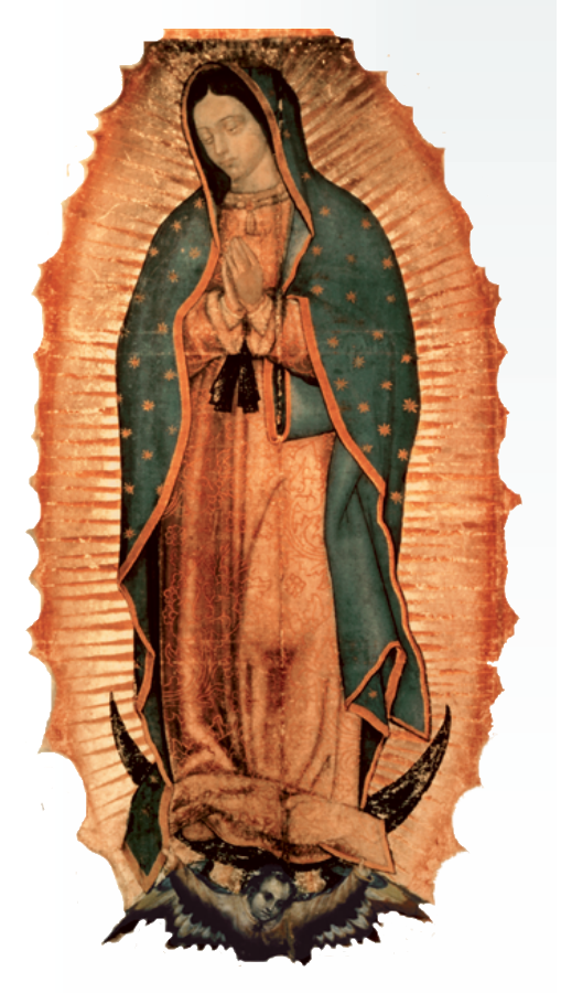
Perpetual Adoration in Central Wisconsin @ The Mother of America Perpetual Eucharistic Adoration Chapel