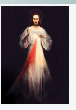
Divine Mercy Jesus, I Trust in you

Located in the former convent of Saints Peter and Paul Catholic Church at 241 Apricot Street, the Marian Center houses the Mother of America Perpetual Adoration Chapel where, since October of 2004, Our Eucharistic Lord has been continually adored by members of the Wisconsin Rapids and neighboring communities. In the chapel hangs the relic image of Our Lady of Guadalupe as well as a digital copy of the Vilnius Divine Mercy painting. The facility also houses life-sized, back-lighted copies of the Shroud of Turin, a small lending library, and a resource center.